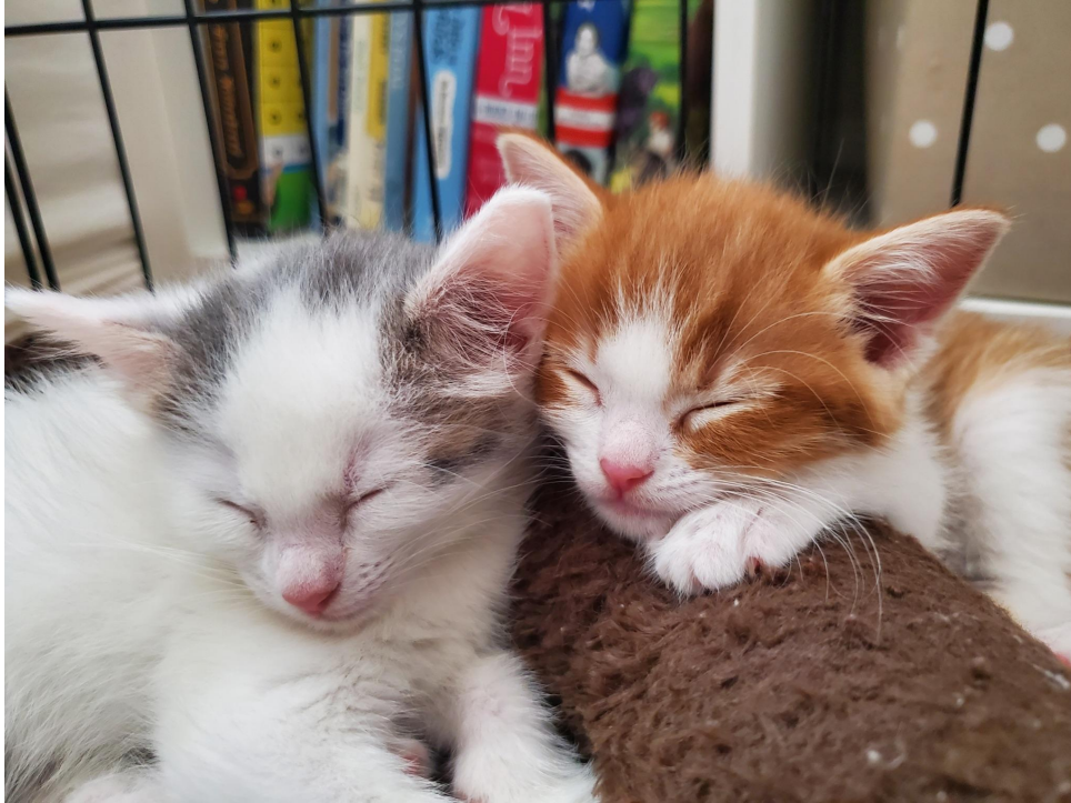
Sophia Adair age 14 "Sleepy Barn Kittens" #5 Beautiful Babies

Two barn kittens snuggled up next to each other taking a nap! Sophia did an excellent job keeping the subject in focus allowing the many textures of this image to show off! The colors and lighting is lovely and she did a great job using a shallow depth of field to blur the background. You can almost hear the kittens purr as they drift off to sleep!